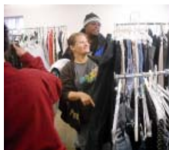
FIG LEAF STORE OPENS FOR STREET YOUTH

This year, Micah 6 assisted the Fig Leaf Store at University United Methodist Church in service to young adults living on the street in Austin. The Fig Leaf provides free clothing as well as a safe place to gather socially and interact with community volunteers. This service has become very popular with as many as 25